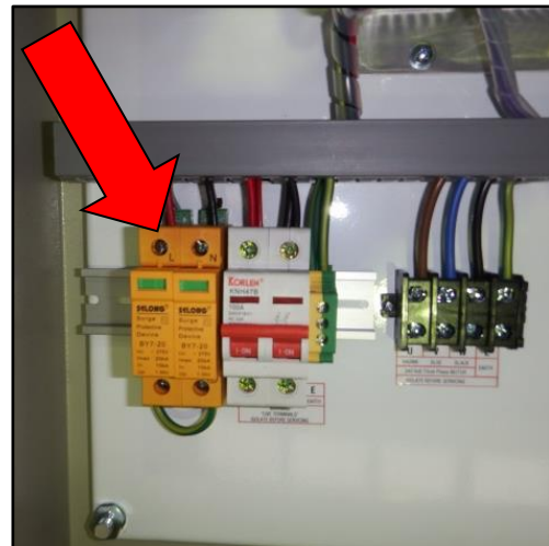
Installed surge arrester in SD75 Cartridge indicator; Green is good, Red is blown