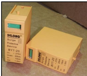
Replacement cartridge Kit Contains 2 cartridges Order # 305 701 377